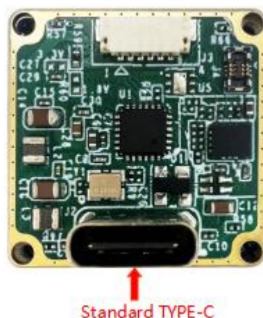
Figure 1.1 TLX02V110F014C Expansion Board

The user expansion component interface adopts the standard USB Type C connector, which includes the power supply interface (5VDC) and one USB 2.0 interface. It also comes with a USB cable, with one end designed to connect to the board's Type C interface and the other end being a standard USB 2.0 interface.